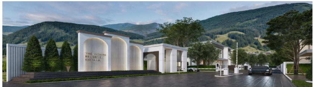
The Menara Hill – The Menara Resident Kamala

Sales Office: 4/11 Moo 4, Srisoonthorn Road, Choeng Thale Sub District, Thalang District, Phuket, 83110