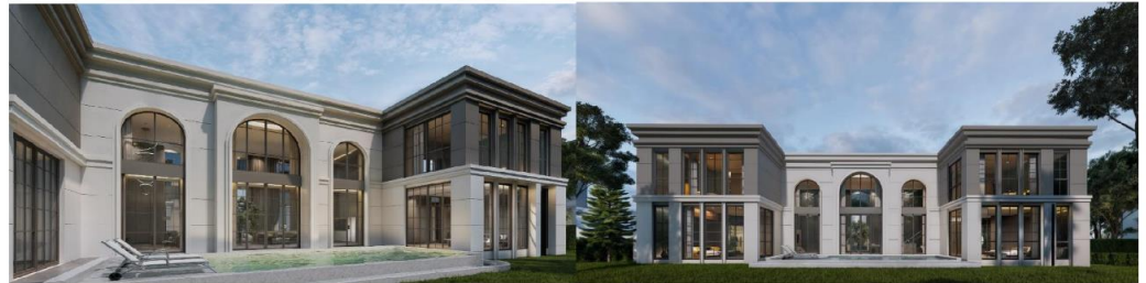
The Menara Hill – The Menara Resident Kamala

Sales Office: 4/11 Moo 4, Srisoonthorn Road, Choeng Thale Sub District, Thalang District, Phuket, 83110