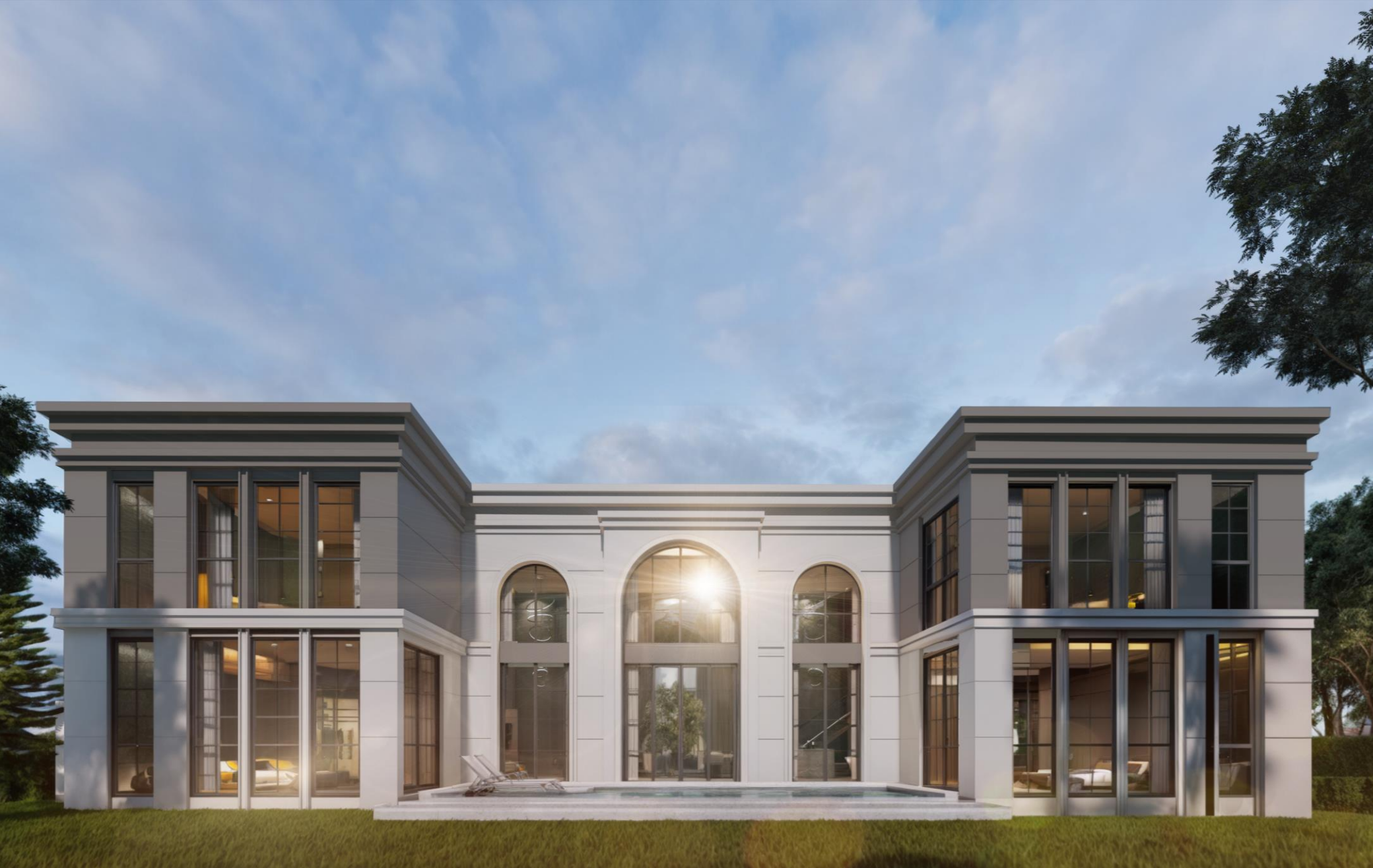
THE KAMALA GRAND TYPE A