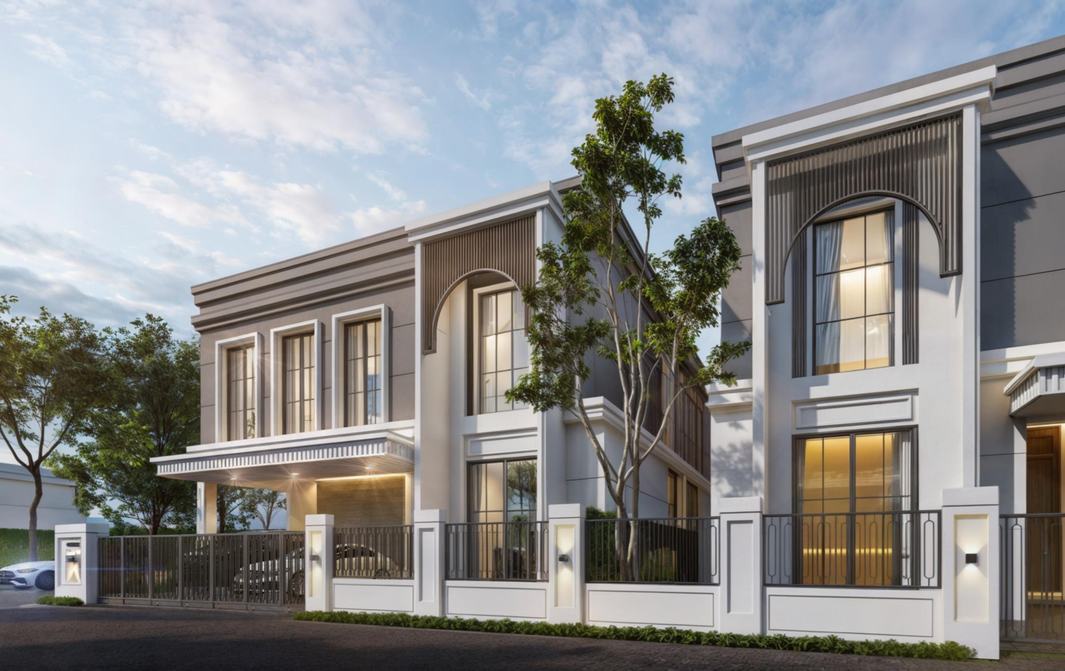
THE KAMALA GRAND TYPE B