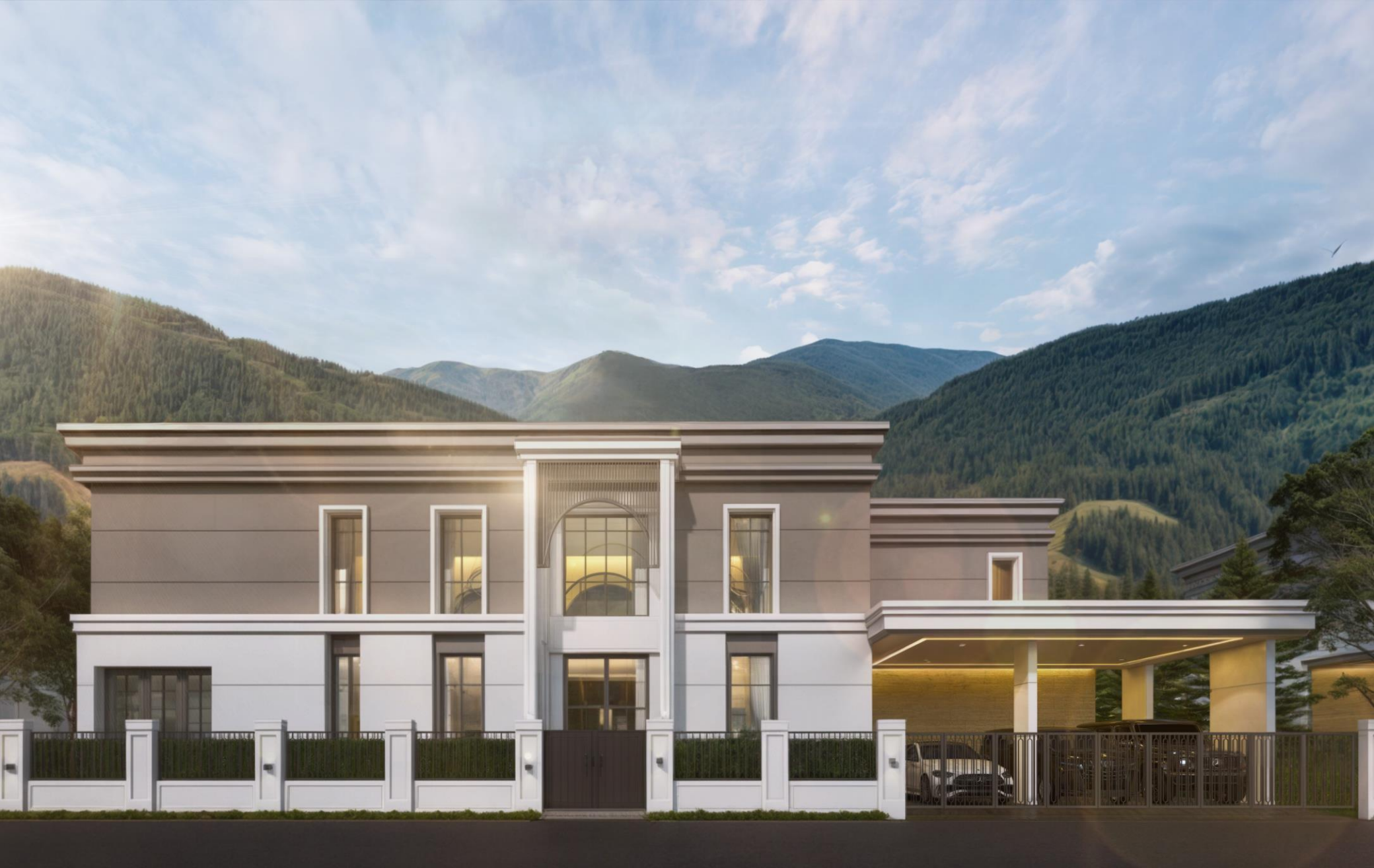
THE KAMALA GRAND TYPE A