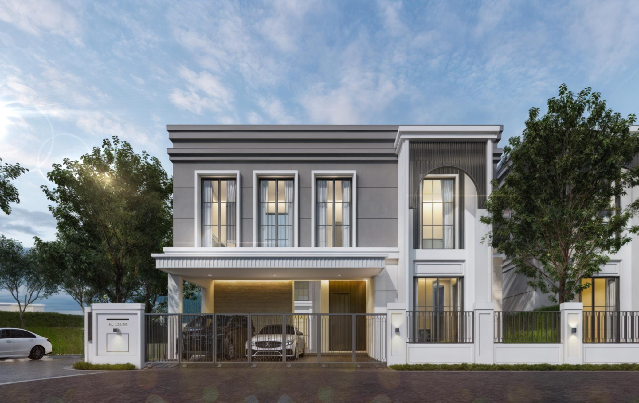
THE KAMALA GRAND TYPE B