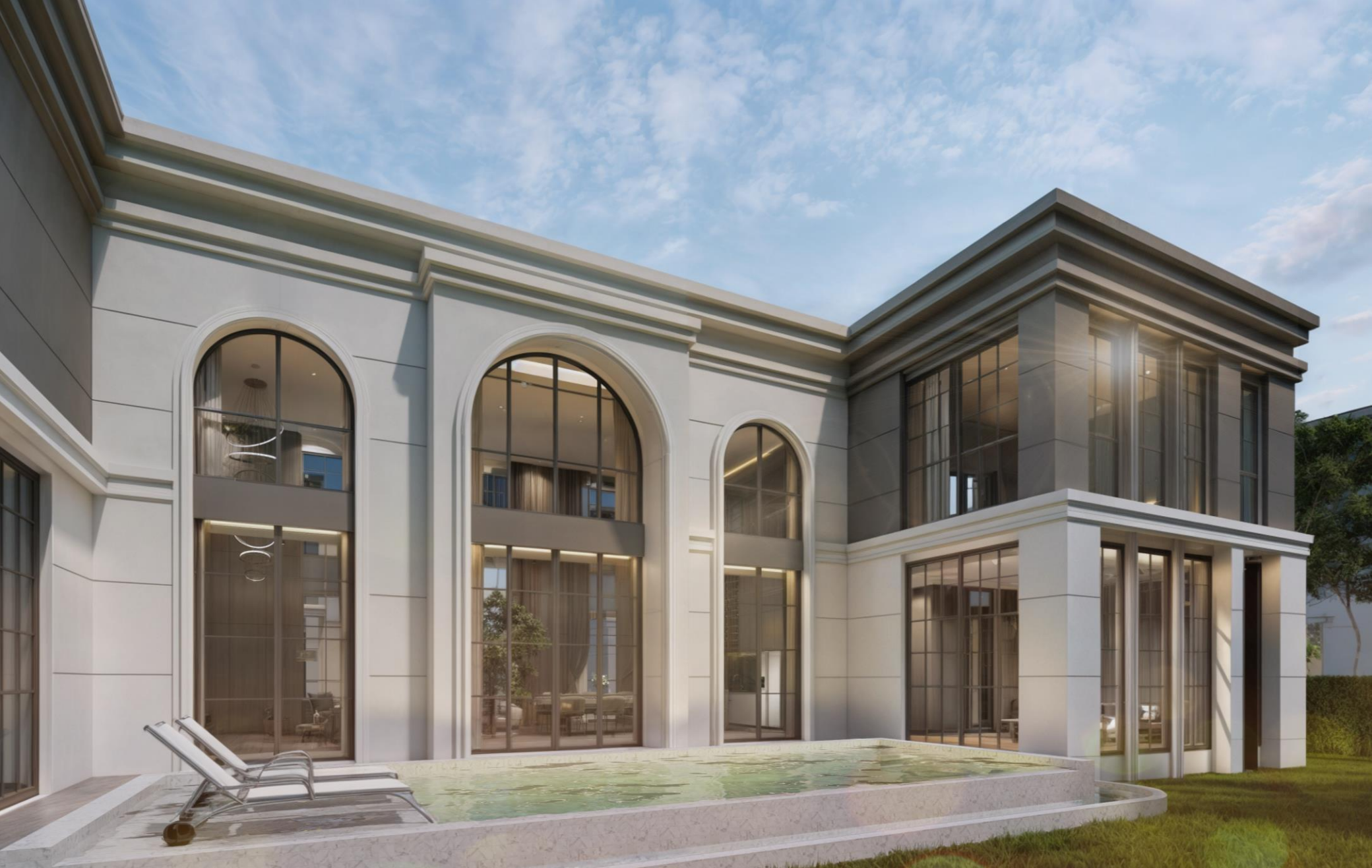
THE KAMALA GRAND TYPE A