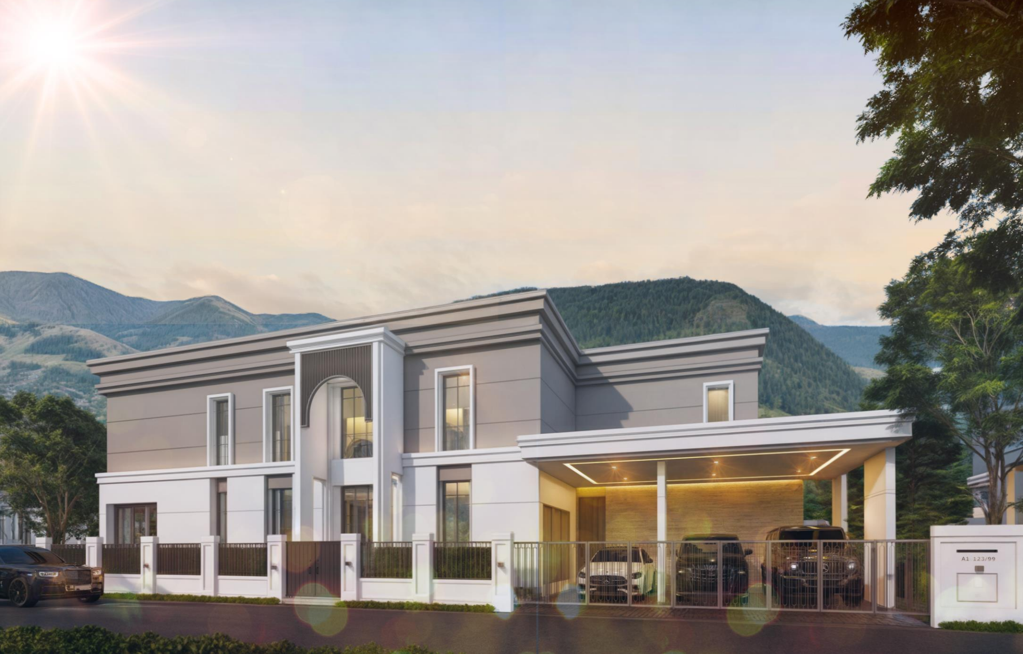
THE KAMALA GRAND TYPE A